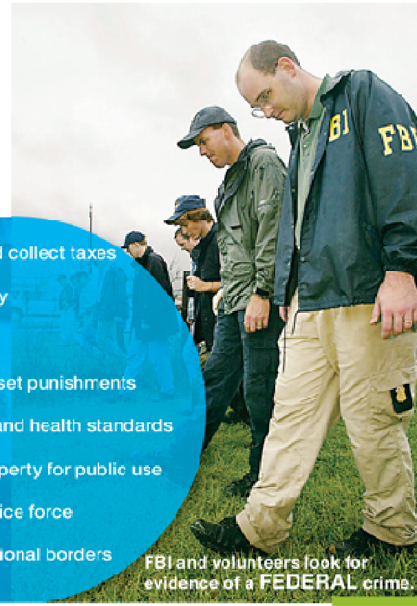
FBI and volunteers look for evidence of a FEDERAL crime.