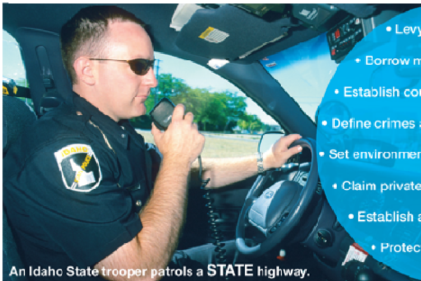
An Idaho State trooper patrols a STATE highway.