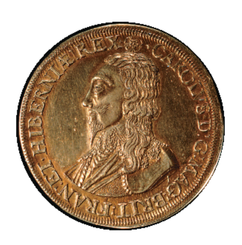
Commemorative coin from the reign of Charles I